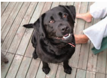
Karl with a K

When I first saw him I felt a strange intrigue; a bond, an attraction that I hadn't felt before. Even though I had been here many times before, searching, looking, pondering, this was the first time I had felt this way. Sitting in his cage, he was smiling at me, so I smiled back. His short, black, shiny, coat shimmered. Deep dark chocolate eyes, floppy ears, a Crest-like smile greeted me as I had a closer look. 78 pounds in mass, (so the paper said), he had lost his way, no one had come to look for him and he was now homeless. How could I turn him down? I had a home and an empty spot for a guy like